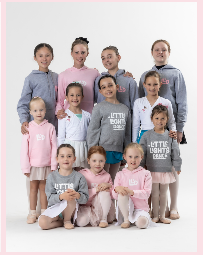
LLD Hoodies, Crewnecks and T-Shirts can be purchased from the studio. We have limited stock currently but will do a pre-order in Term 1.